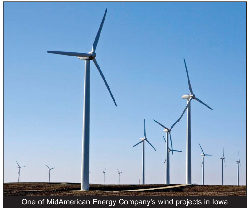
One of MidAmerican Energy Company's wind projects in Iowa